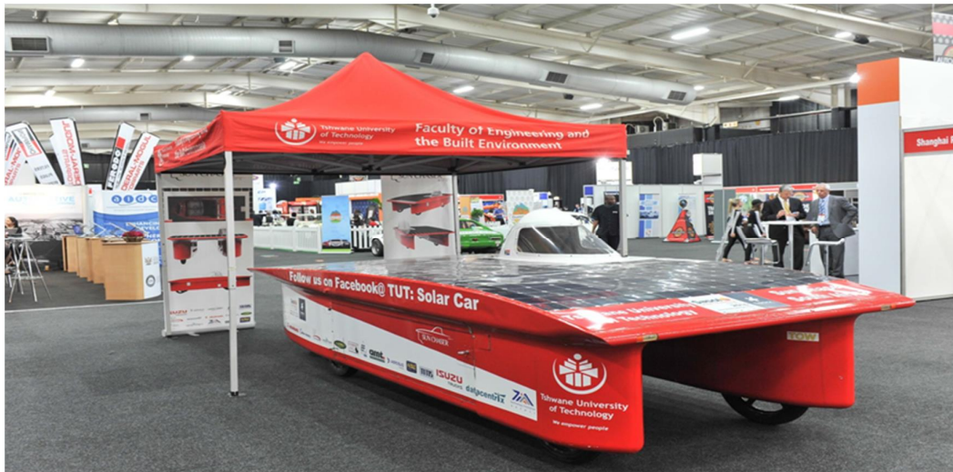
One of the solar cars designed by the Tshwane University of Technology on display